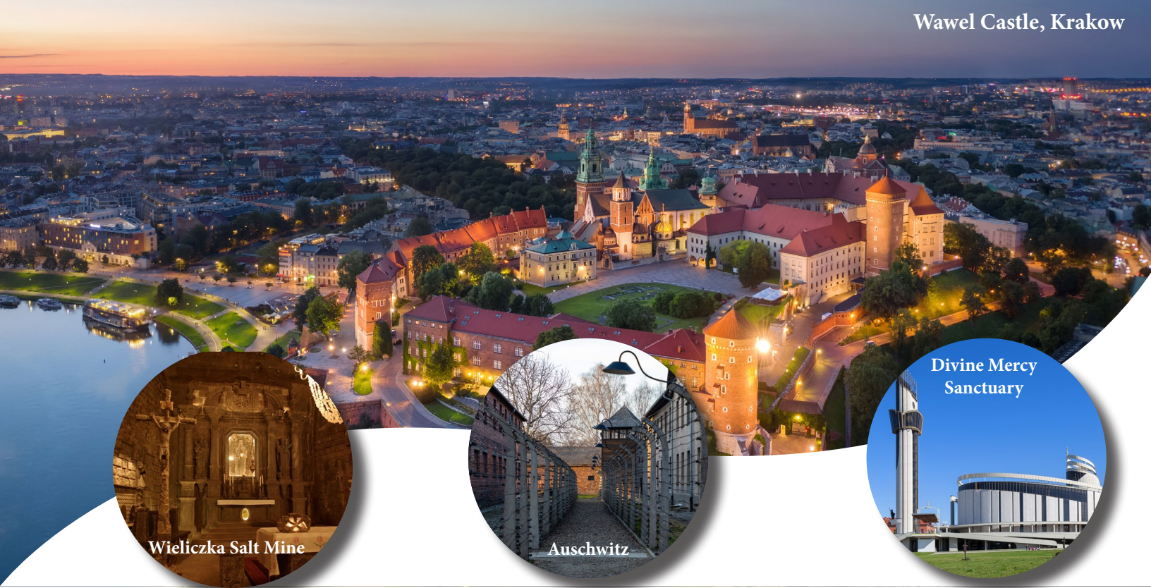
Wieliczka Salt Mine